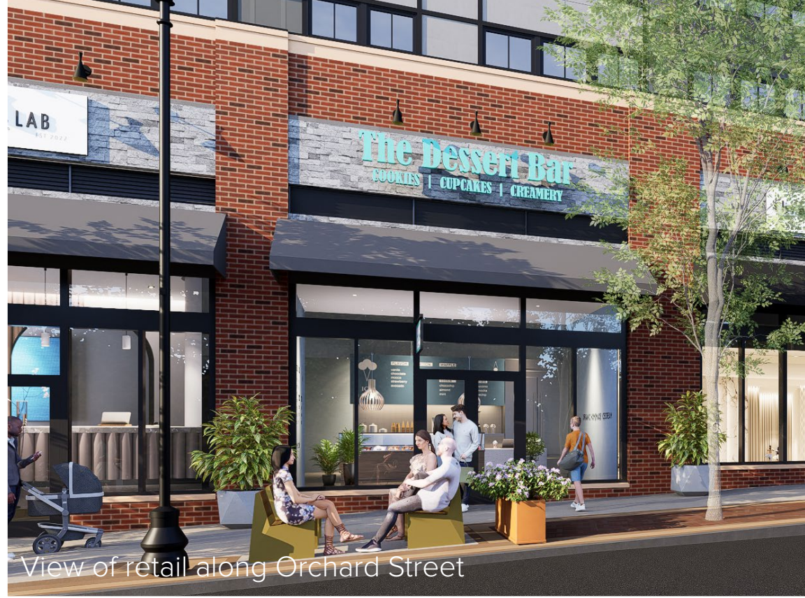
View of retail along Orchard Street