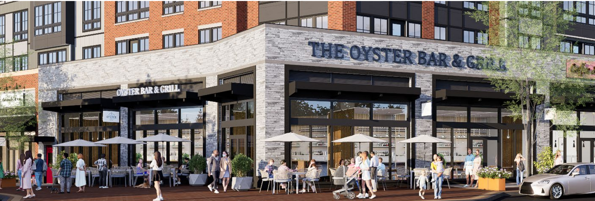
View at corner of West Avenue & Orchard Street Note: Outdoor seating shown is subject to City approvals