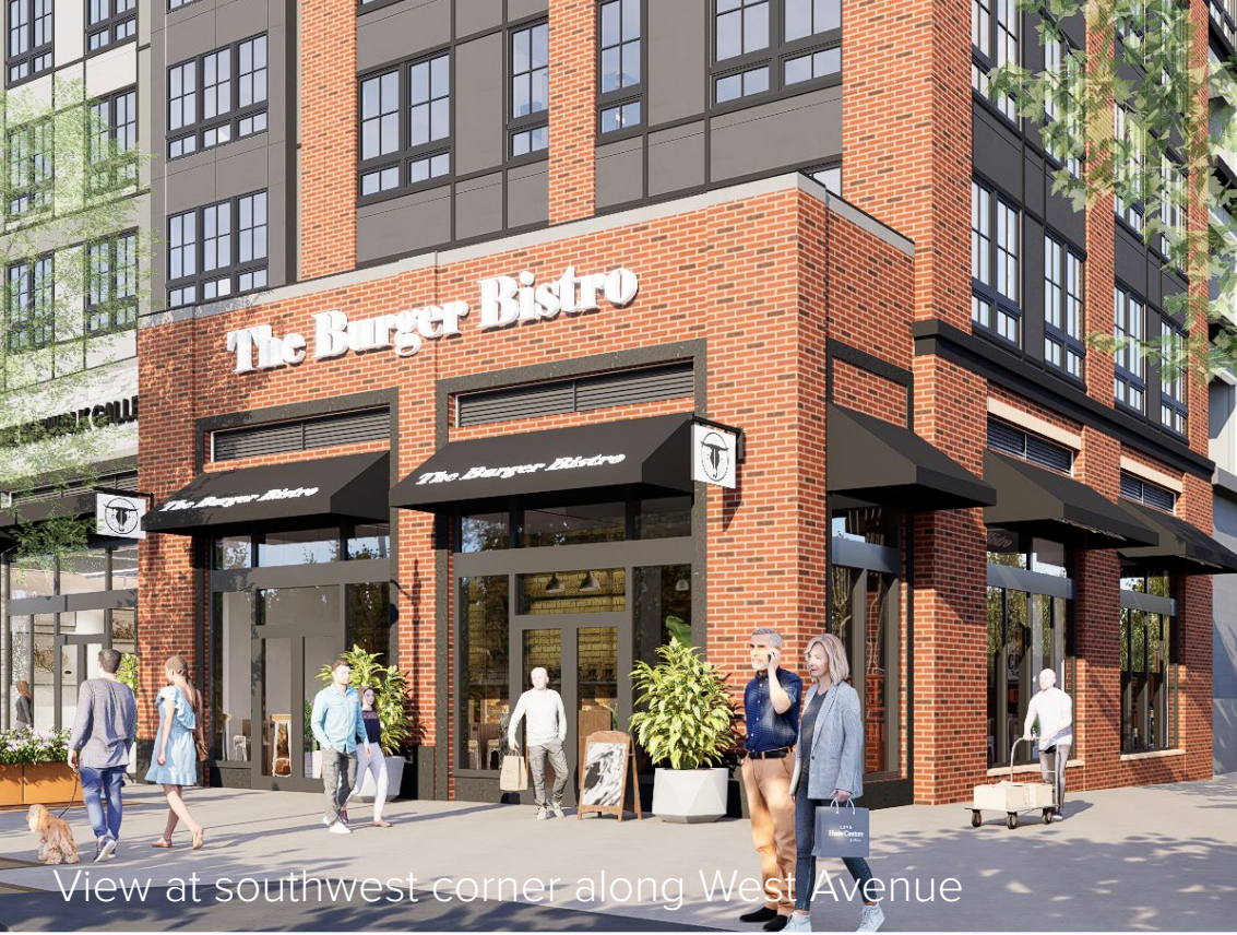
View at southwest corner along West Avenue