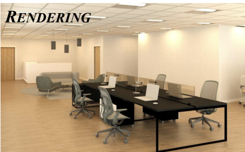
SAUGATUCK COMMERCIAL REAL ESTATE LLC