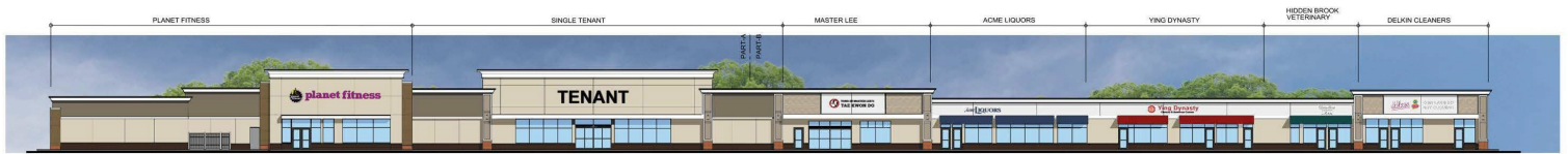
BIG VALUE PLAZA ELEVATION