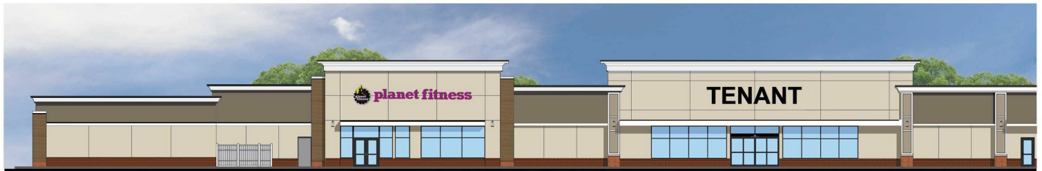
BIG VALUE PLAZA ELEVATION - PART A